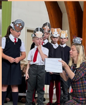
HARVEST POETRY - YEAR 4