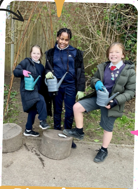
Planting out the Sweet Peas

Year 6 have been undertaking a full set of practice SATs, using last year's paper. They have been persevering and doing their very best! Well done.