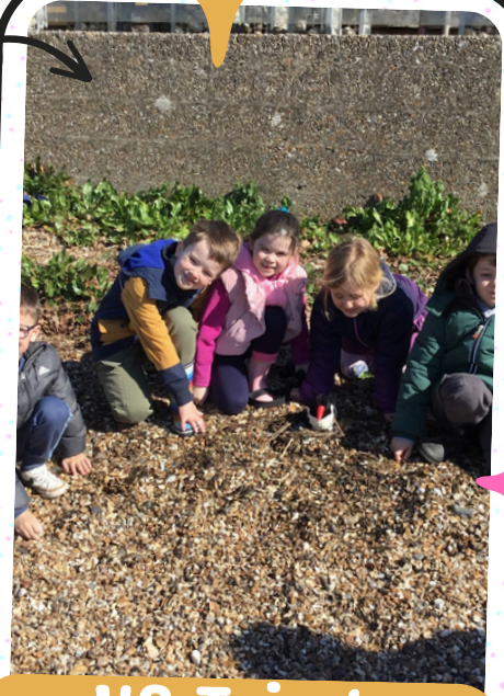
Y2 Trip to Chichester Harbour

Year 6 have created a working model of the circulatory system...on the playground. Ask a year 6 child for more information!