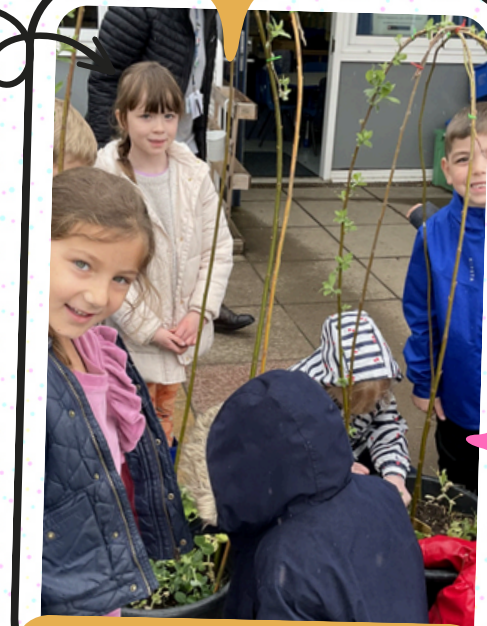
Potatoes and Peas!