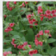
Adonis vernalis 'Black Star'