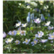
Anemone nemorosa 'Alba'