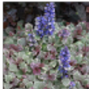
Ajuga reptans 'Burgundy Glow'