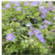
Clematis 'Jackman's Blue'