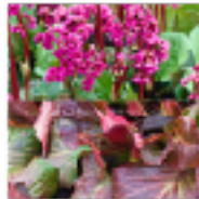
Bergenia 'Bressingham Ruby'